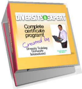
Check out the Bonus Stuff!